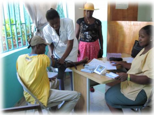
Nurses at the clinic