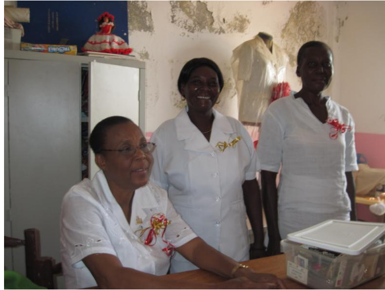
Figure 1 Ladies of the Madeline Church

Needs for the sewing center are cupboards, a propane gas stove, locked storage units, thread, crochet thread, yarn, church kitchenware, utensils, plates and silverware and more space.